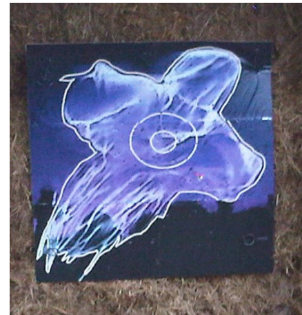
AWESOME TARGETS FROM THE HALLOWEEN SHOOT!